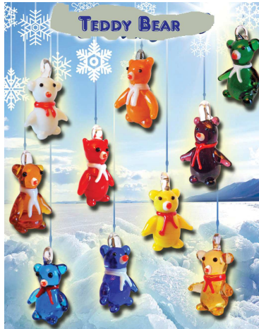
Necklace not included

These teddy bears and starfishes are not only Fèves, but also beautiful pendants. Offer a gift to the queen of the day for ever.