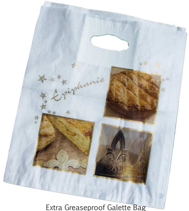
Extra Greaseproof Galette Bag