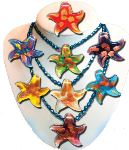
Necklace not included